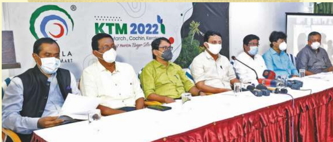
Press meet convened by Adv. P. A. Mohammed Riyas, Hon'ble Minister for Tourism, Govt. of Kerala on 30th Nov. 2021.

This years' KTM had accorded importance to Kerala Tourism's pioneering Caravan Tourism and products in adventure tourism activities in addition to its USPs like Ayurveda, Backwaters etc.