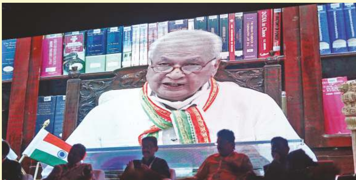
His Excellency, the Governor of Kerala Shri Arif Mohammed Khan inaugurating the KTM- 2022 online.